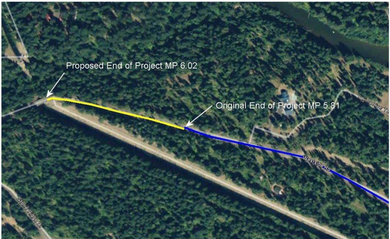
West end of project