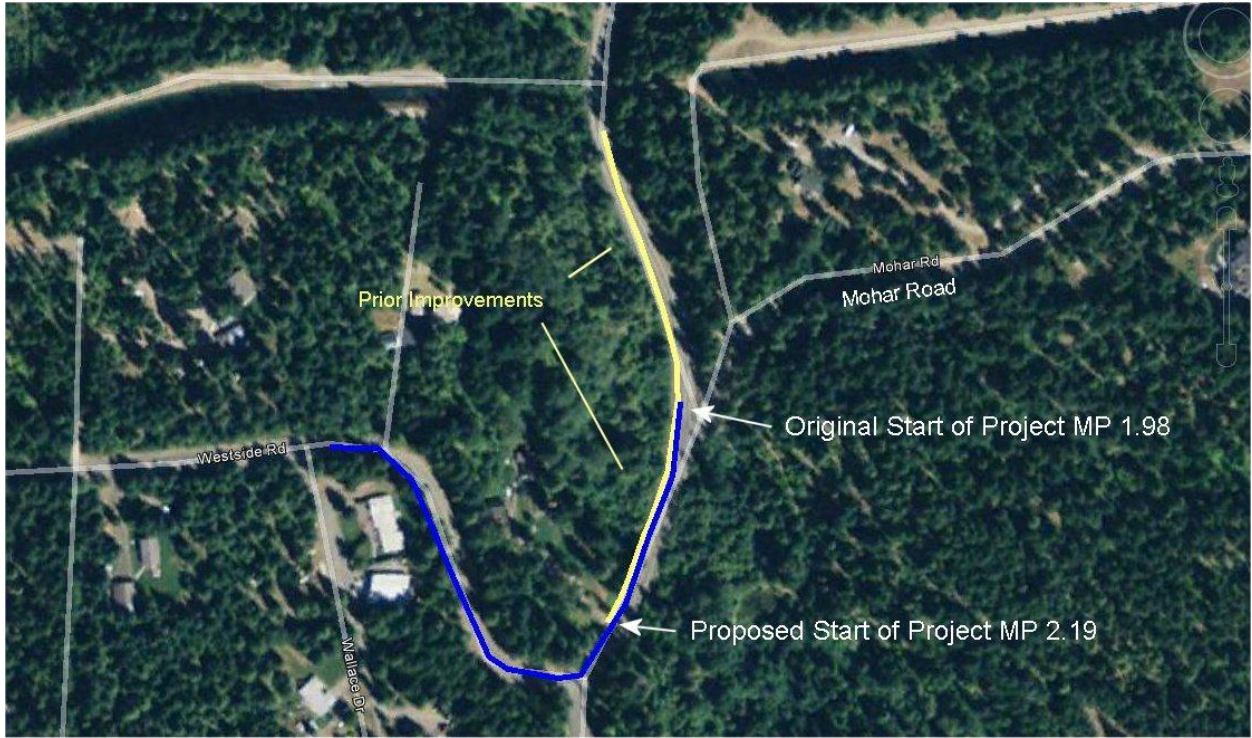
East end of project